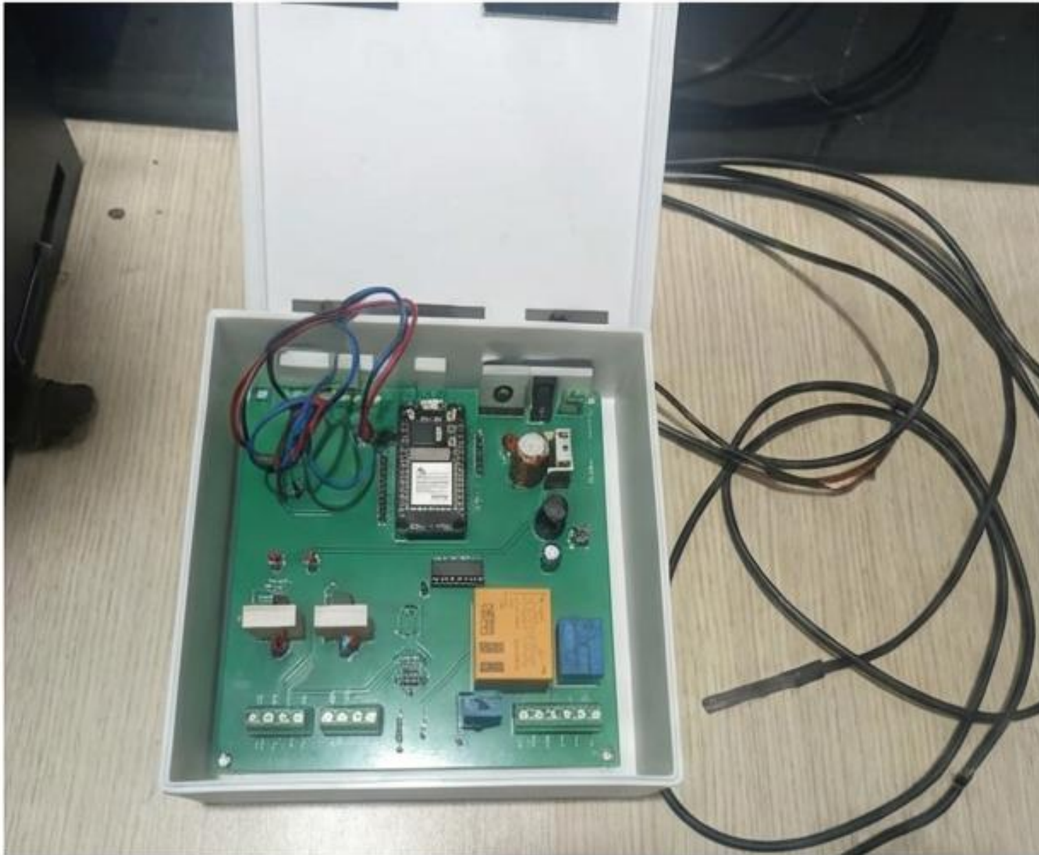
SOLAR PHOTO VOLTAIC THERMAL SYSTEM