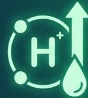
GREEN HYDROGEN PRODUCTION