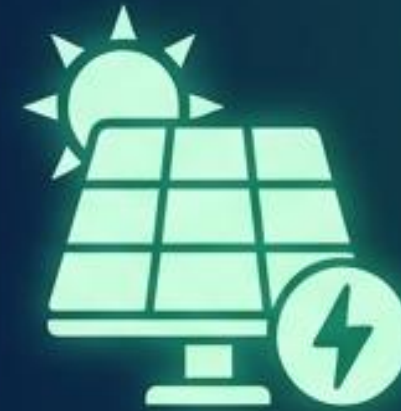
SCALABLE SOLAR POWER