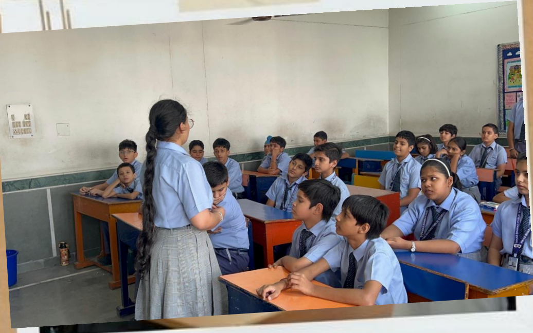
IN CLASS SESSIONS