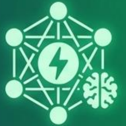
DECENTRALIZED SMART GRIDS

Massive untapped potential for scalable solar power, green hydrogen production, and decentralized smart grids.