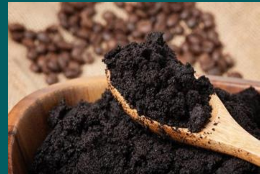
coffee grounds waste